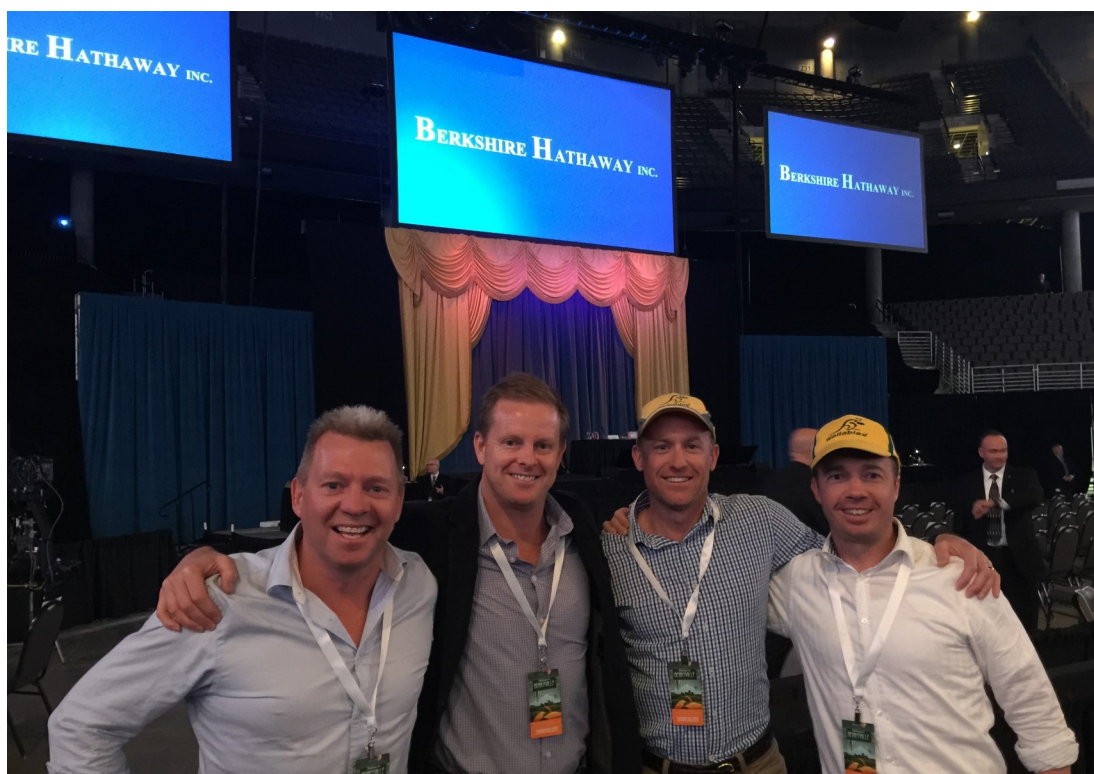
Above: Our early start meant that we secured front row seats

We have divided this note up into different topics and end with a number of additional quotes and miscellaneous material. We hope you enjoy reading the note and we welcome any questions you may have – simply send them to info@bkilimited.com.au